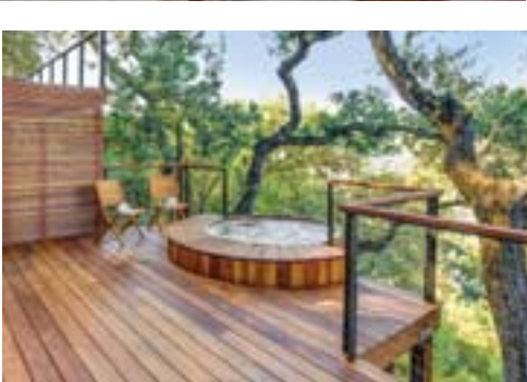
Coming Soon in Orinda 4 Bedrooms + detached office | 2.5 Baths | 2,538± Square Feet | 1± Acre